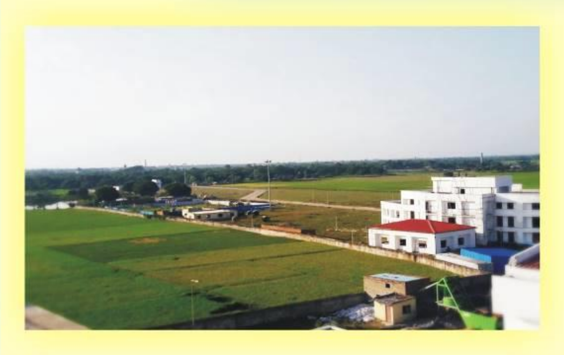
Narayanpur, Malda - 732 141, West Bengal, India (http://www.gkciet.ac.in)